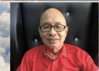
by: Bro. Ernie Acayan PAHINA 5