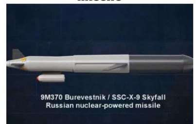
9M370 Burevestnik / SSC-X-9 Skyfall Russian nuclear-powered missile

Ipinagmalaki ni Russian President Vladimir Putin ang matagumpay nilang pag-testing ng nuclear-powered Burevestnik cruise missile.