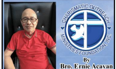
By Bro. Ernie Acayan

Bagama't hindi pa tiyak ang bilang nito, ayon sa naturang tagapagsalita, may 'good number' anyia na naghain ng kanilang pagbitiw maipakita lamang na sila'y 'in good faith' sa tanggapan.