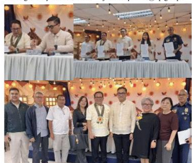
The Presidential Task Force on Media Security (PTFOMS) and the National Police Commission (NAPOLCOM) formally signed a Memorandum of Agreement today, 24 October 2025, marking a significant step toward creating a safer and more supportive environment for media workers across the country.