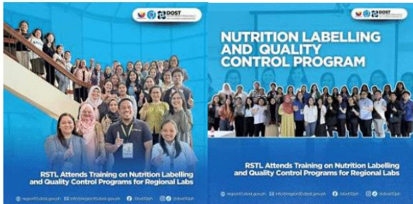
Shelf-life Evaluation Laboratory successfully participated in the Training on Nutrition Labelling and Refresher Course on Laboratory Internal and External Quality Control Programs held on September 30 to October 1, 2025, at the DOST-FNRI Training Hall, Bicutan, Taguig City. The training was hosted by the Food and Nutrition Research Institute (DOST-FNRI).

By equipping the analysts with refreshed skills and new perspectives, the training fosters greater confidence, accuracy, and efficiency in laboratory operations. Ultimately, this contributes to the DOST's mission of promoting food safety, consumer protection, compliance with regulations, and competitiveness of local products in both national and global markets.